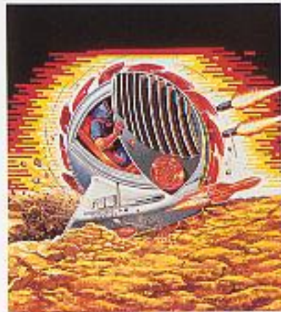
Level 2-2: Buzzboar™